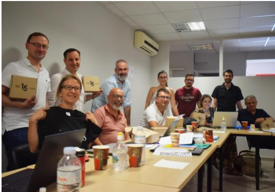
The team working at the project during the meeting in Athens

This meeting, however difficult to organize, in particular for travel and its constraints, finally came to fruition.